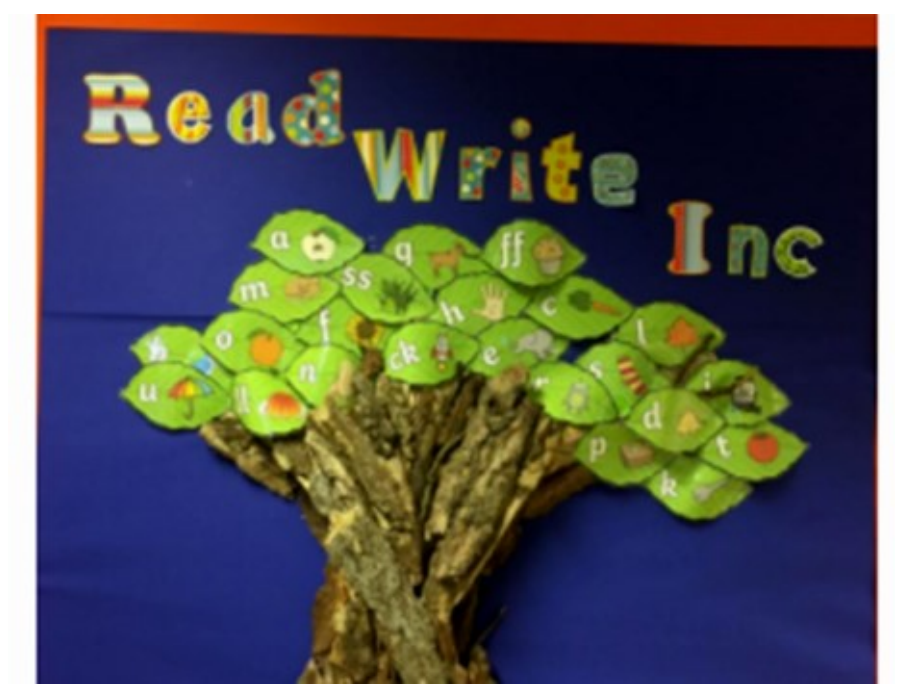
Some of the school have been using Read Write Inc to develop their literacy skills