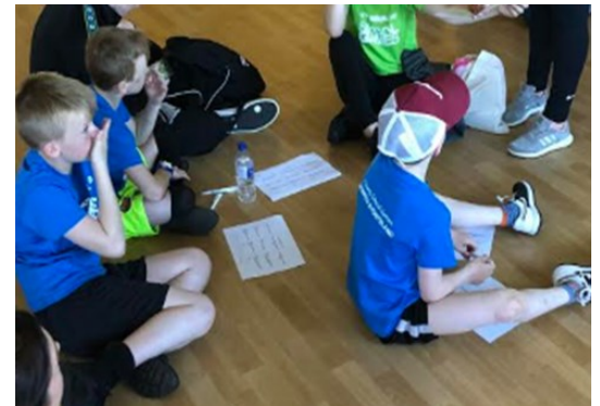
[Northumberland County Games]

During our PE session we have been trailing some exercise and dance videos—these have been a big hit with some of our group and also the staff!